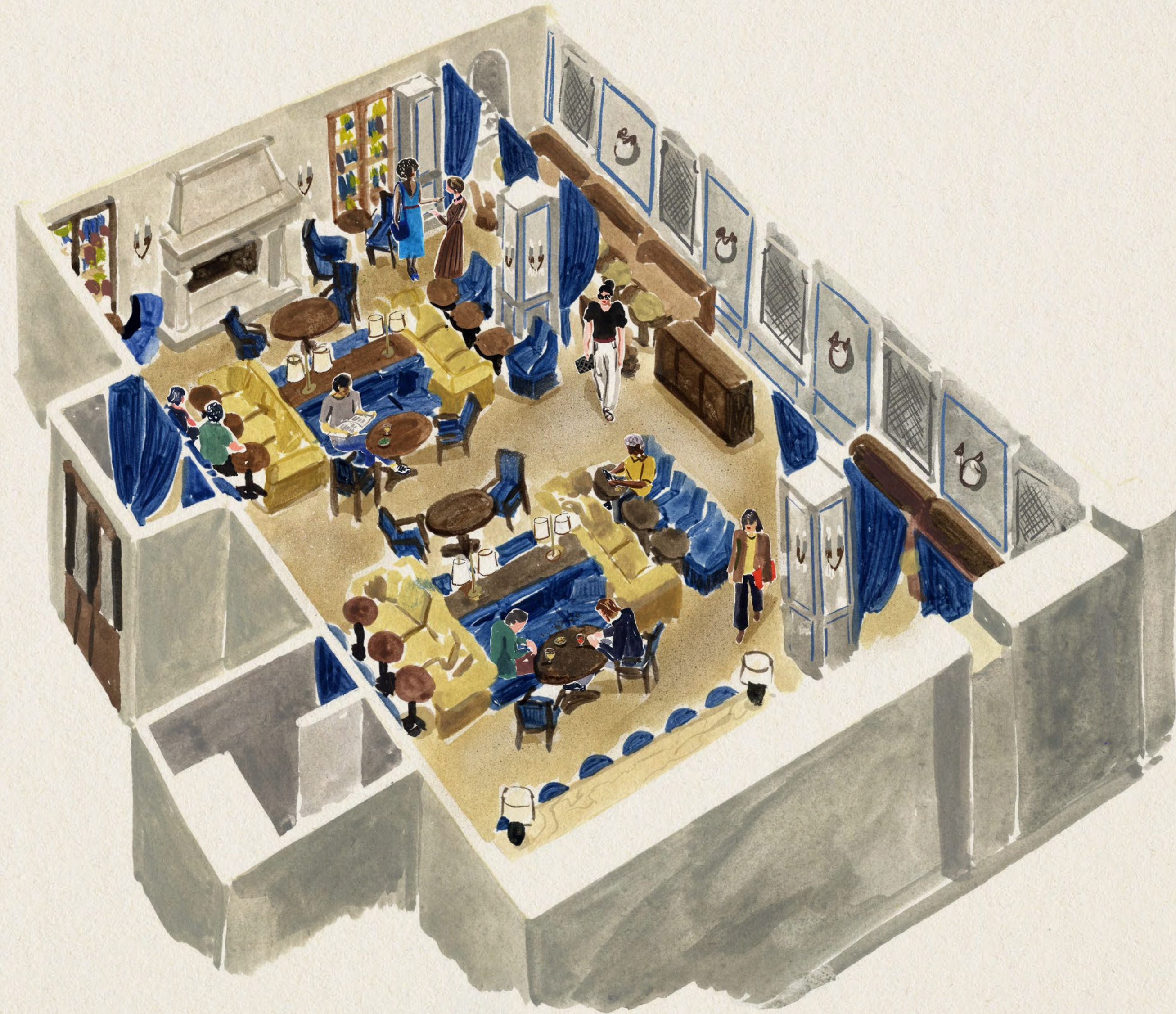
The Living Room