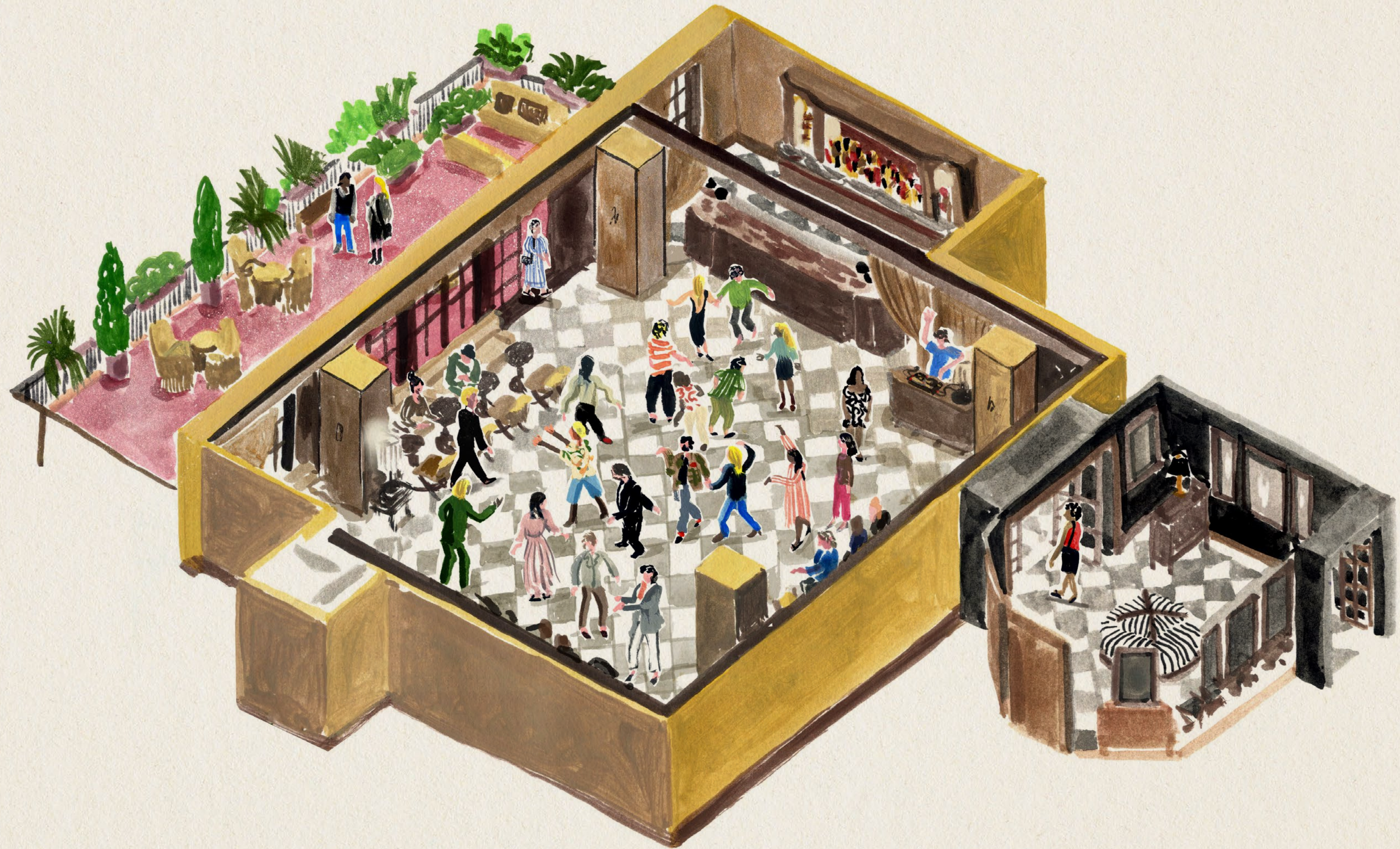
The 9 th Floor