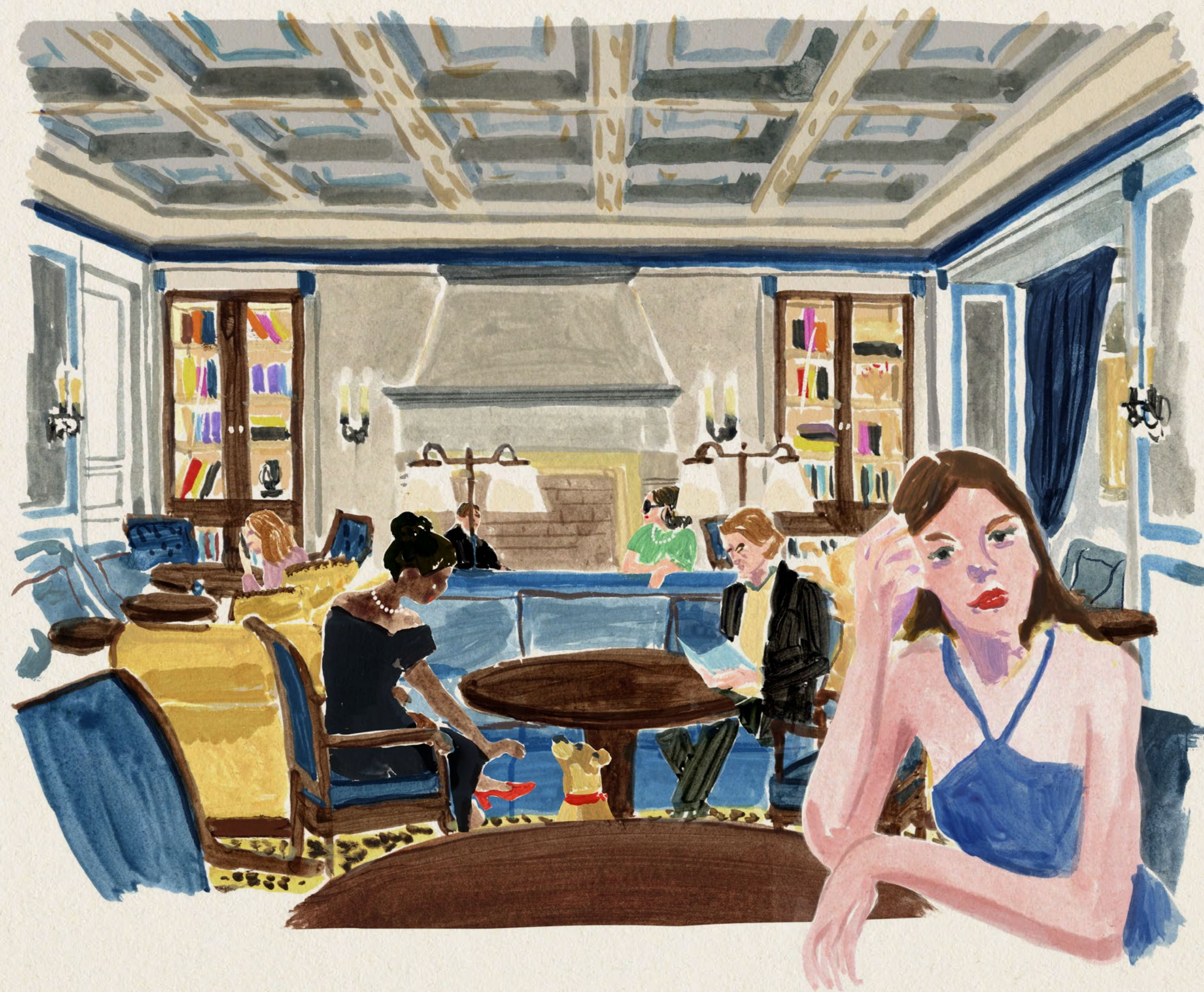
The Living Room